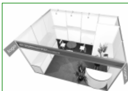
Luxury Standard Package