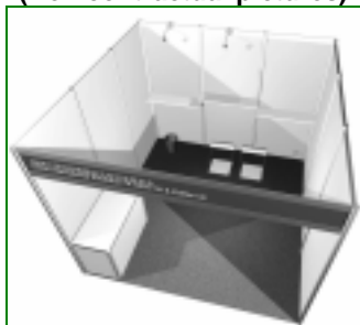
Basic Standard Package